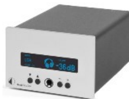
Head Box DS