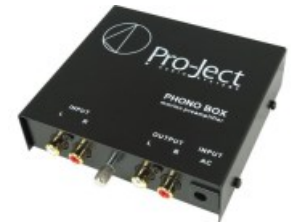
The very first Box Design Product - Phono Box

Today we have the largest selection of audio products of any HiFi manufacturer in the world. Pre-amplifier, power amplifier, D/A converter, streamer, headphone amplifier, phono stage, integrated amplifier, you name it! All of them are pure HiFi stereo.