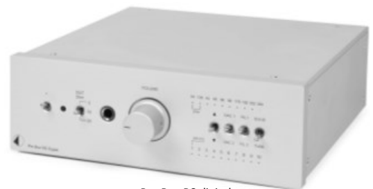
Pre Box RS digital

In face of the big success of the RS line we redesigned the DS line.